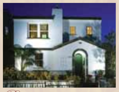
Portico San Diego, California