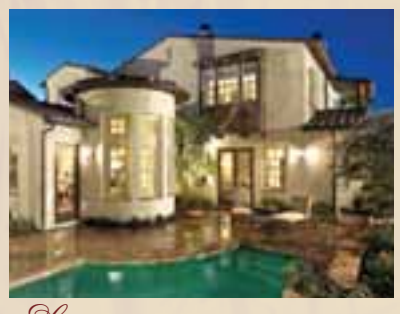
Segovia Yorba Linda, California